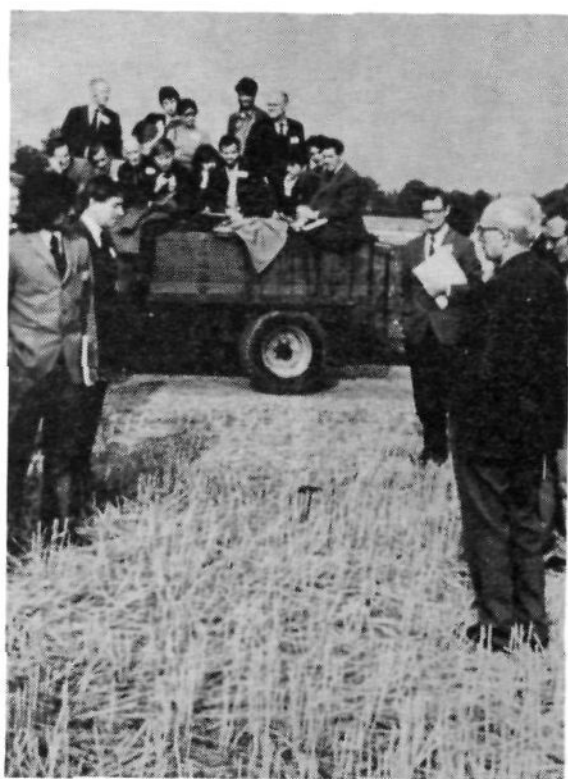
British Society of Soil Science Silver Jubilee Meeting